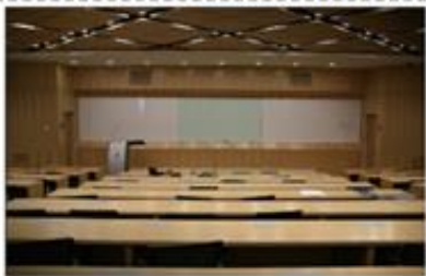
<SK Conference Hall, 1F>