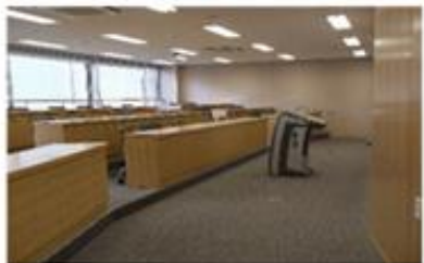
Lecture Theatre, 3F, 4F, Bldg. 57-1