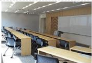
Lecture Theatre, 1F, Bldg. 57-1