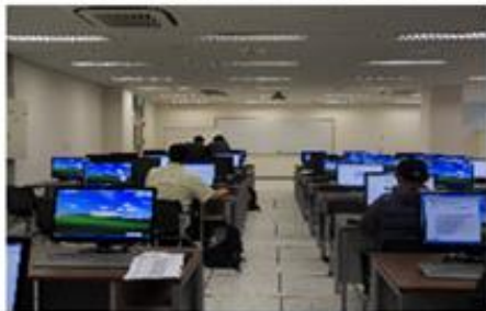
Computer Lab, B1