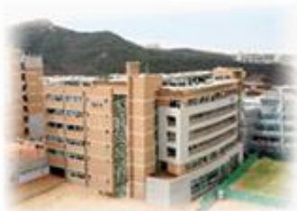
Whole view of GSPA Bldg. 57-1