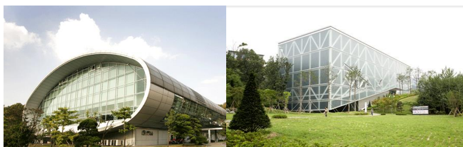
POSCO Sports Center